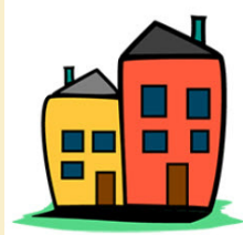
Home Usability Program

Our researchers are partnering with centers for independent living and their consumers to increase community living and participation.