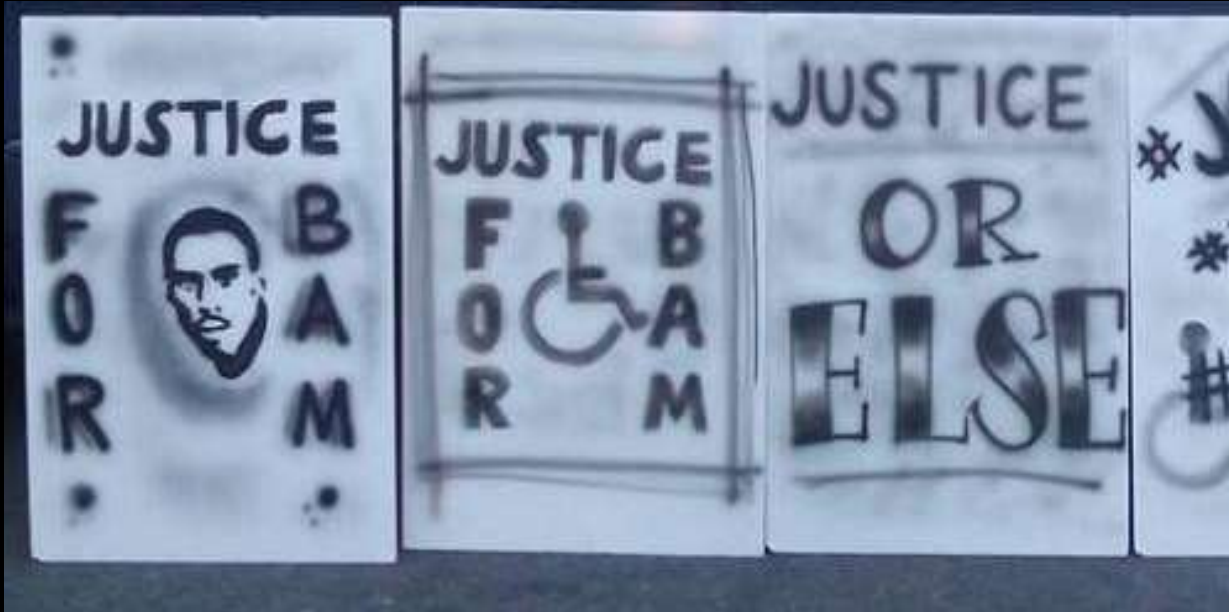
Signs created to protest the death of Jeremy McDole.