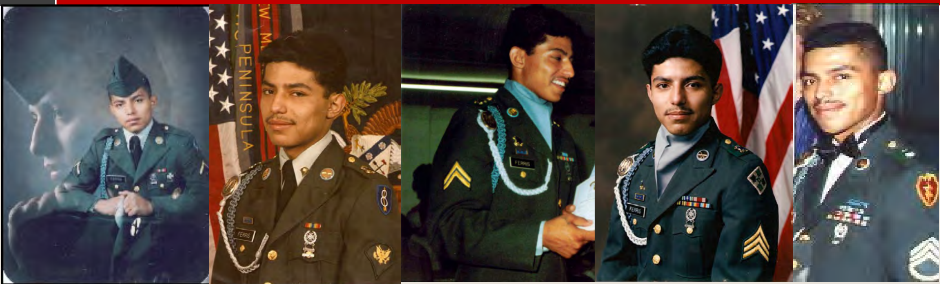
My Story: Growing up (and getting older) in the Military