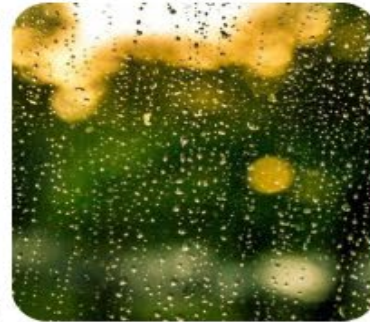
STAYING ON COURSE