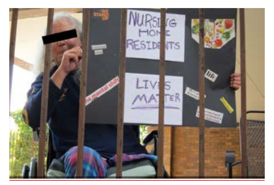
Nursing home resident protesting inside locked facility during COVID pandemic.

In June of 2020, FEMA announced that they would be providing reimbursement under