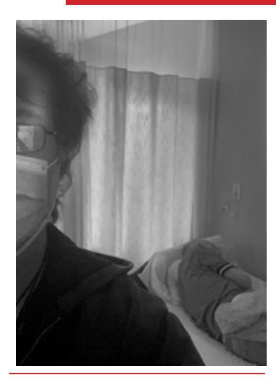
Long-term care residents in shared room during COVID pandemic.

The Supreme Court's Olmstead Decision mandates that people with disabilities have reasonable access to the residential settings of their choice. Under non-disaster circumstances states routinely rely on CILs to help fulfill this mandate by employing their competencies in disability-related supports. In 2016, a federal rule explicitly directing CILs to include transitions from institutions in their work further reinforces their central role in integrating and enfranchising people with disabilities. The Administration on Community Living rule states that CILS must: