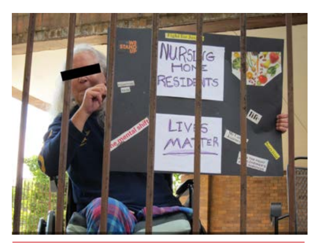
Nursing home resident protesting inside locked facility during COVID pandemic.

Shortly after FEMA's announcement, the agency published an addendumin July (excerpted in Appendix A) that explicitly names CILs as an eligible provider for personal assistant services during declared disasters. Since its publication, RTFCIL has successfully applied for reimbursements for portions of its relocation work and anticipates further reimbursements for related activities during the federally declared COVID disaster. RTFCIL, as a SILVER affiliate, has since become a national advocate for centering CILs in emergency relocation work.