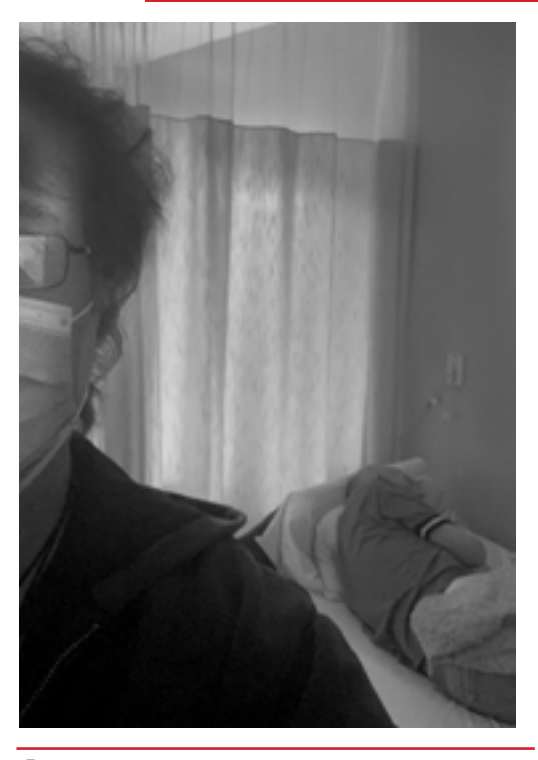
Long-term care residents in shared room during COVID pandemic.

Court's Olmstead Supreme Decision mandates that with disabilities have reasonable access to the residential settings of their choice. Under non-disaster circumstances states routinely rely on CILs to help fulfill this mandate by employing their competencies in disability-related supports. In 2016, a federal rule explicitly directing CILs to include transitions from institutions in their work further reinforces their central role in integrating and enfranchising people with disabilities. The Administration on Community Living rule states that CILS must: