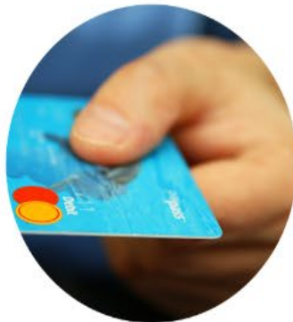
BUDGETING & FINANCE